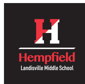
HLMS H stkd red wht