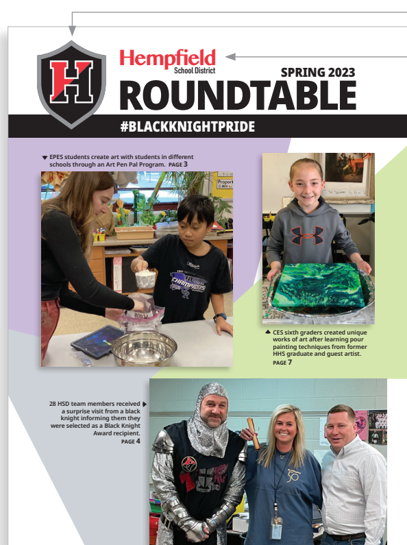
"HSD Shield H" Hempfield Shield with initial icon

See examples of using Icons and Complementary Assets in conjunction with the Logotype.