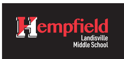
HLMS H-shdw horz red wht