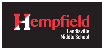
HLMS H horz red wht